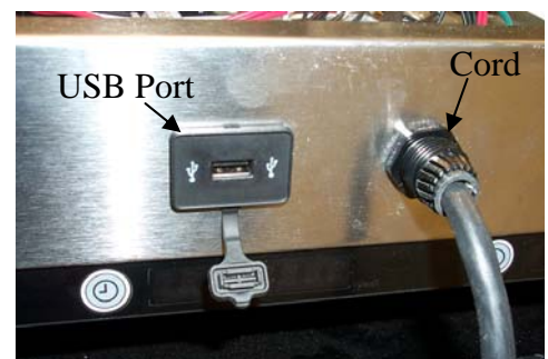
USB port located near the cord.